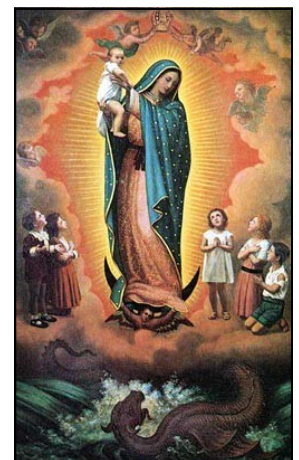
Defender of Children