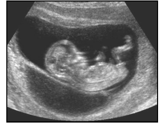
Ultrasound - 12 weeks