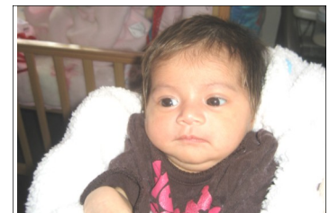
Six Weeks Old