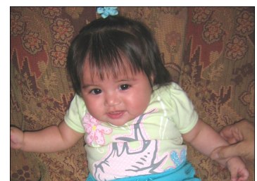
Five Months Old