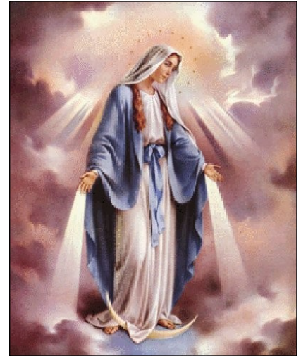
Feast of the Assumption August 15th