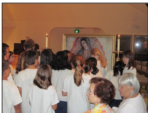
School Children at Queen of Apostles Parish

After all, a child who walks with his mother by his side always has the courage to face anything.