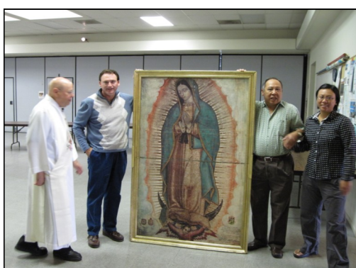
St. Luke Parish, Foster City