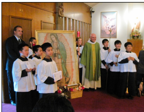
Our Lady of Peace Parish, Santa Clara