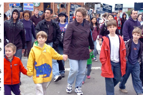
Walk for Life WC-2009 San Francisco, CA