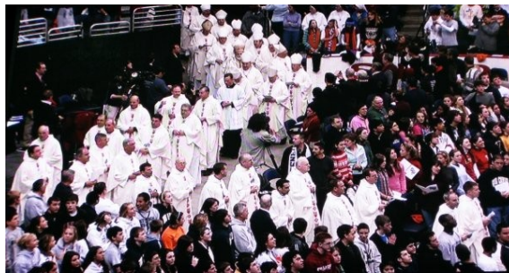
Hundreds of Priests Marching for life

Eight years ago I probably would have listed a number of reasons for considering abortion, but as I look back I can tell you that as a teenager I was young, foolish, and desperate to hold onto my partner. The reason I share this experience is because it is pivotal in explaining—not justifying—but explaining what may be going through the mind of the pregnant teenage girl who walks into the St. Juan Diego Women’s Center. The pregnant teenage girl who considers abortion is concerned with matters of the self, though she may not view the situation that way. She will try to convince herself that although she wishes the circumstances were different, abortion must be ok—after all, our society had legalized it. And she may allow that “rationalization” to take precedence over her conscience’s warnings, over God’s own law.