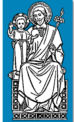
Feast of St. Joseph March 19th

If you are unable join us along the battle line; at least say a prayer and lend us your support.